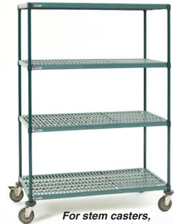
For stem casters, see catalog sheet #11.20