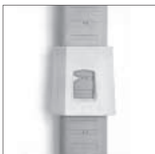
Wedge lock connector attaches easily to post.