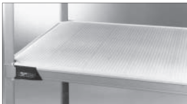
Solid Shelf Mat