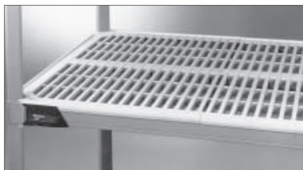
Open-Grid Shelf Mat