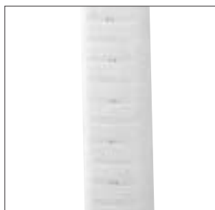
Posts are numbered at 1" (25mm) intervals.