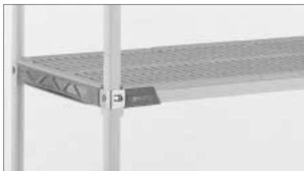
MetroMax mat kits with Microban® antimicrobial product protection are available to upgrade existing MetroMax storage systems.