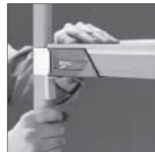
Shelf lowers onto wedge lock connector for a secure fit.