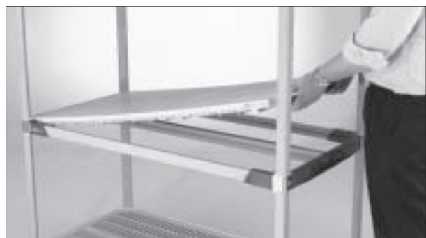
Solid and open-grid shelf mats remove and interchange quickly.